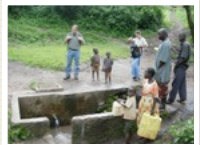
VILLAGE'S FREE POLLUTED WATER SOURCE