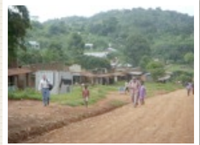
MAIN STREET, MABAALE